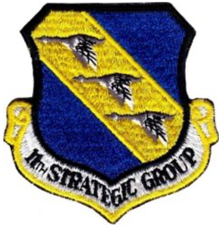
11 Strategic Group emblem

characteristic long-range formation flying, endurance, and alertness, which are likewise qualities of the wing.